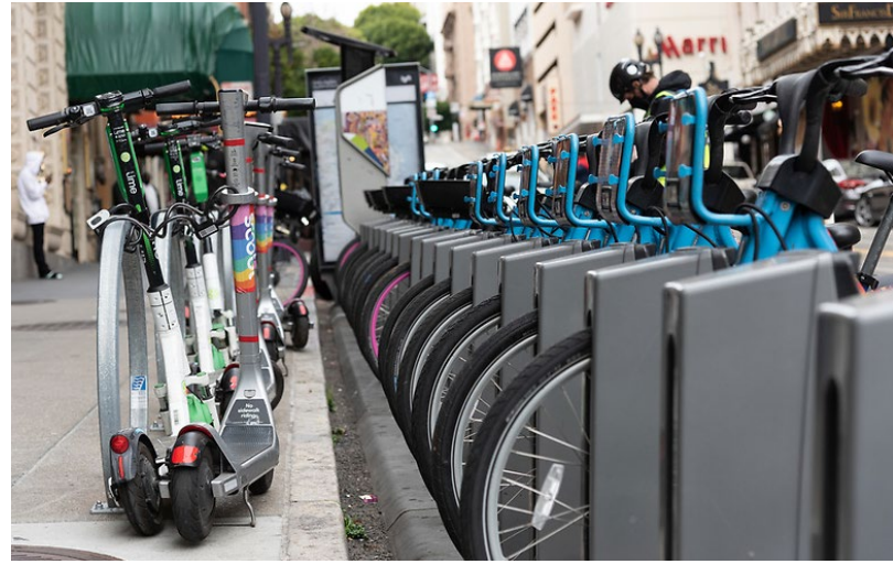
San Francisco Municipal Transportation Agency