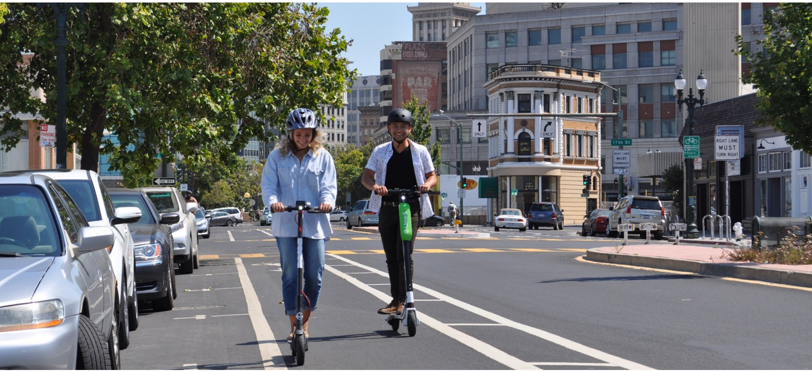
City of Oakland