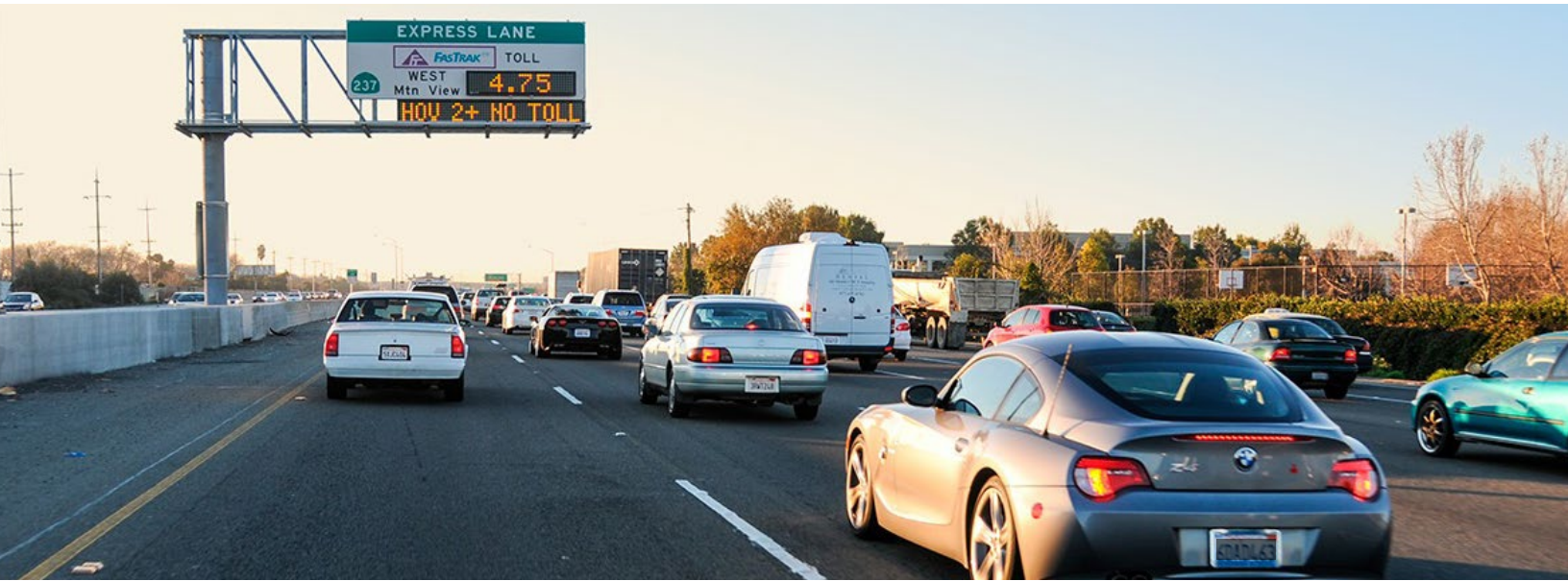
Bay Area FasTrak