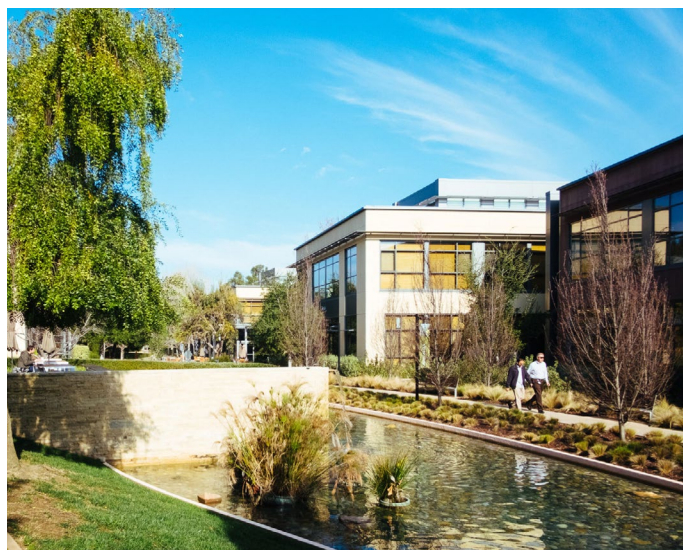
Stanford Research Park