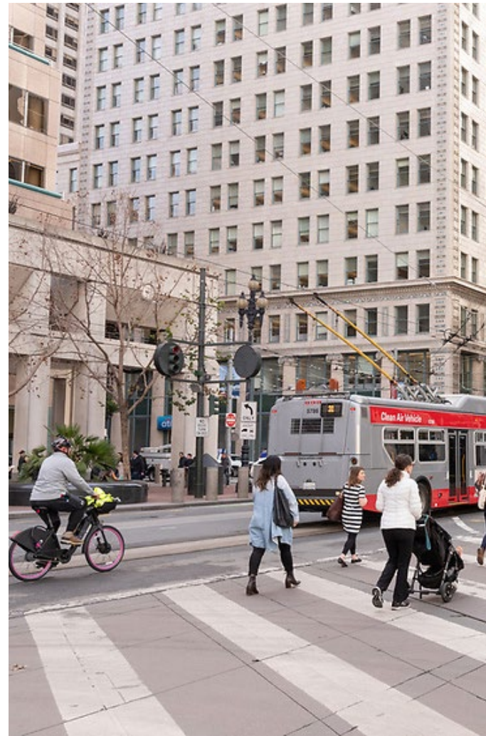
San Francisco Municipal Transportation Agency

Suburban environments are often in office parks or close by an urban center. In the Bay Area, examples include cities like Fremont and Foster City and office parks like Bishop Ranch in San Ramon, Stanford Research Park in Palo Alto or Hacienda