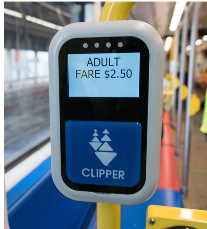
San Francisco Municipal Transportation Agency

Private transit service is employer-funded and exclusive to your employees, or service can be extended to all employees in a business park. This program approach requires sourcing a fleet, operators, and human capital to manage operations like scheduling, routing, and more. Employers pursuing this program approach often choose to procure a full-service vendor. Whether in-house or through a vendor, providing private transit requires significant resources to launch and sustain. Private transit service is most appropriate for large and mega employers who are more likely to have the volume of participation to support the program. Service can be roundtrip from various origin points in the region to worksite campuses, or last-mile service from the nearest transit station to worksite campuses. Providing a private transit program requires more resources, research, planning, and program evaluation in comparison to strategies that support public transit use. Be prepared to make data-driven decisions about where service is most needed, and to regularly review program performance to make adjustments based on demand. We also encourage you to prepare an emergency or modified service plan in the event of a natural disaster, widespread health pandemic, remote work policy trends, and other influences.