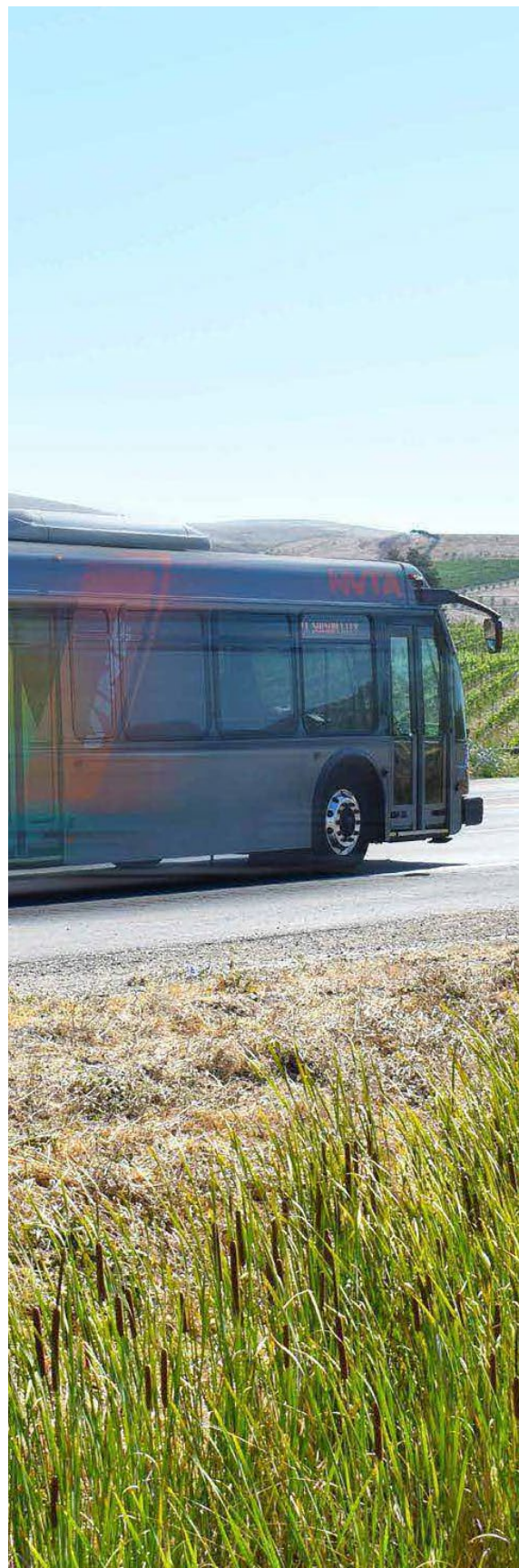
Napa Valley Transportation Authority